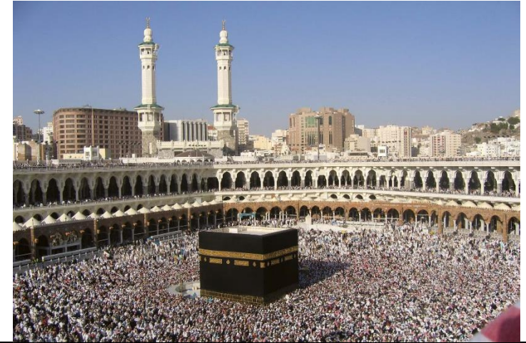
The Kaaba at Mecca